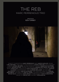
THE REB MUSIC VIDEO CLIP