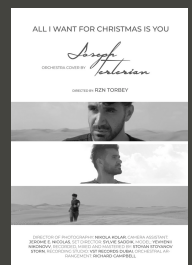
ALL I WANT FOR CHRISTMAS IS YOU MUSIC VIDEO CLIP