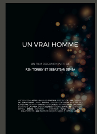
UN VRAI HOMME DOCUMENTARY